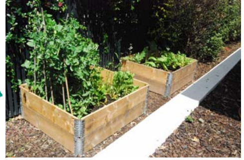
2 Double height vegetable beds