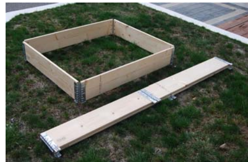
2 collars: one opened & one folded (above)

* Due to temperature & humidity changes in storage and during transportation, an occasional crack or split might appear. The protruding ends of the hinges can be sharp, so please handle with care. Simply use your gardening gloves at all times when setting up your raised beds!